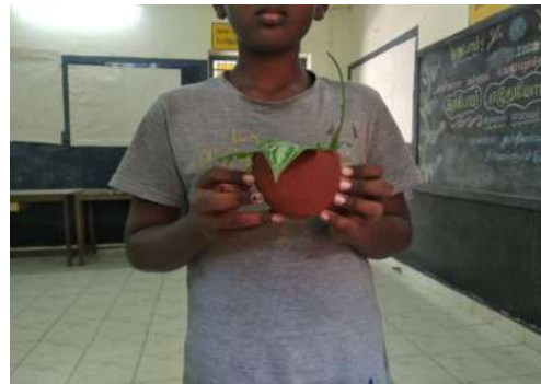
Plant pot using coconut shell

Strength increased to 20 by the end of the January.