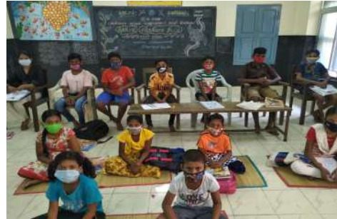
Reading and Writing Tamil

Taught them maths activities and made them to do the sum by play way method. They were interested to do the maths by activity method.