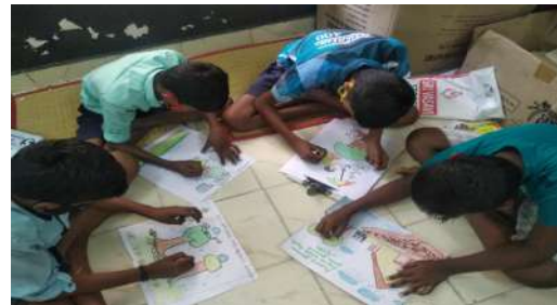
drawing and painting