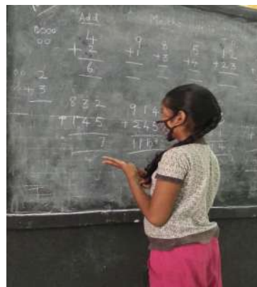
Doing addition sums