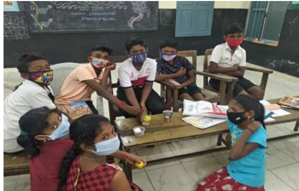
Density experiment using lemon

We provided materials for craft work, painting and drawing. Students were very happy to make different things and we allowed them to take the things made by them to home. Parents were happy to see their craftwork. We encouraged the students to participate in painting competition. They got prize for their painting. Parents thanked Asha for running the mini school.