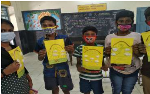
Activity on watercycle

We provided materials for craft work, painting and drawing. Students were very happy to make different things and we allowed them to take the things made by them to home. Parents were happy to see their craftwork. We encouraged the students to participate in painting competition. They got prize for their painting. Parents thanked Asha for running the mini school.